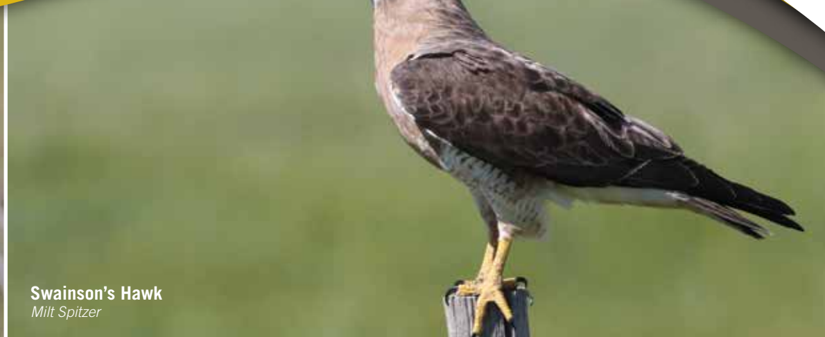
Swainson's Hawk