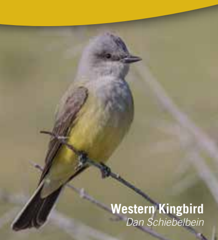
Western Kingbird Dan Schiebelbein

In addition to the campgrounds at Sandy Point and Empress, some additional tourist facilities including gasoline are available at Empress and at Burstall, Saskatchewan.