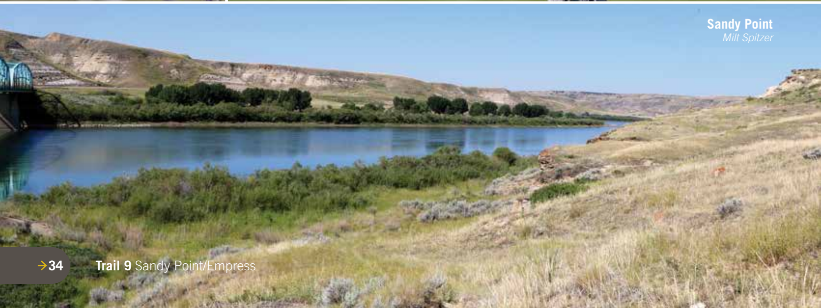
Sandy Point Milt Spitzer