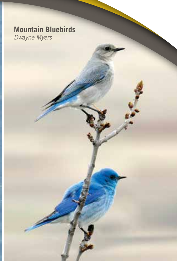
Mountain Bluebirds Dwayne Myers