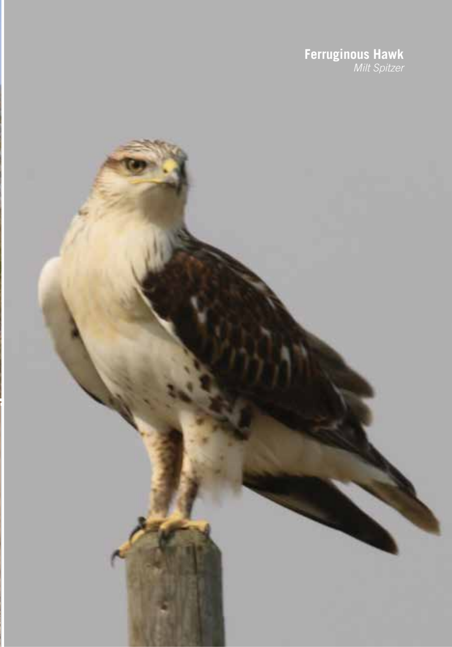
Ferruginous Hawk